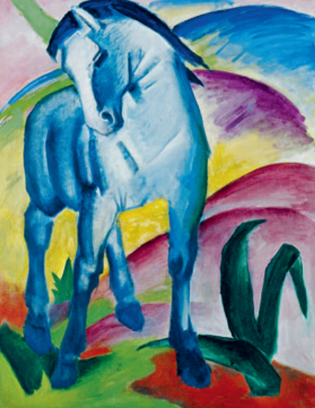
Blue Hors

A wealth of top-class museums and collections, displaying exhibits from Antiquity to the present day, are waiting to be explored in Munich. For many centuries, the Bavarian royal family, the Wittelsbachs, promoted the arts in the city that now boasts a centrally located 'Kunstareal' art hub with museums of world renown. This is where you will find the largest collection of works by the 'Blauer Reiter' movement, for example. The museum, partly housed in the former residence of the 'princely painter' Franz von Lenbach with its idyllic garden, is one of the most beautiful spots in the city. The house in the style of a Tuscan villa forms a stunning counterpoint to the new, gleaming golden building designed by the architectural firm Foster + Partner. Following the gift made by the artist Gabriele Münter in 1957, the museum now holds works by Wassily Kandinsky, Gabriele Münter, Alexej von Jawlensky, Marianne von Werefkin, Franz Marc, Paul Klee, August Macke and many others. Under