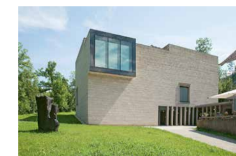
Franz Marc Museum – Art in the 20th Century