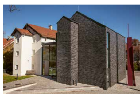
Museum Penzberg – Sammlung Campendonk

into the 1950s. Since 2016 the new Museum Penzberg – Sammlung Campendonk has been home to the largest collection of his work. With his reverse glass paintings in particular he skillfully created artworks of unique beauty and fascination.