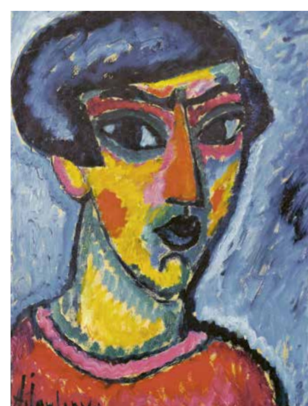
Alexej von Jawlensky Head in Blue, 1912 Buchheim Museum der Phantasie