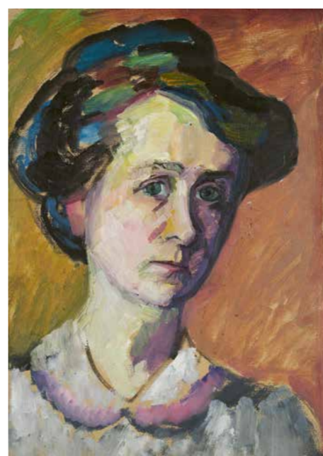
Gabriele Münter Self-Portrait 1909 Schloßmuseum Murnau

The Schloßmuseum in the castle in the centre of the town houses an exceptional collection. Its core comprises works by Gabriele Münter, the artists of the 'Neue Künstlervereinigung München' and the 'Blauer Reiter' – including Kandinsky, Marianne von Werefkin and Alexej von Jawlensky. The works exhibited show the motifs the artists found for their pictures in Murnau and the surrounding area from 1908