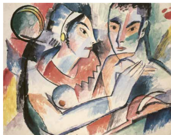
Heinrich Campendonk, Lovers (Adda and Heinrich), 1912, Museum Penzberg – Sammlung Campendonk

The area around the Osterseen lakes that stretches from Lake Starnberg southwards to the undulating foothills around Penzberg, is one of nature's real treasure troves. The 19 lakes near Iffeldorf present an impressive spectrum of colours, from silver-grey to turquoise green, set against the incomparable panorama of the Alps – a magical landscape that attracted Franz Marc to Sindelsdorf at the beginning of the 19th century. And with him his artist friends Kandinsky, Jawlensky and Münter who often spent time in the summerhouse in his garden. In 1911, at the age of 21, Heinrich Campendonk (1889–1957) came to Upper Bavaria from the Rhineland and became the youngest of the 'Blauer Reiter' artists. During his search for motifs for his paintings he was impressed by the mining town of Penzberg with its miners' houses and pitheads. His paintings from this phase were only the start of his own very independent artistic output which continued