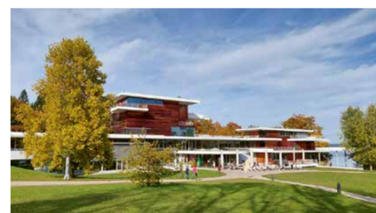
Buchheim Museum der Phantasie

The Five Lakes' Region is the most popular destination for day-trips from Munich. The lush green hills with Lake Starnberg, Lake Ammer and a number of smaller lakes offer breathtaking views of the Alps. Unspoilt farming villages, grand villas, Baroque churches, monasteries and castles characterise this unique area. Attractive cycling and hiking trails around the lakes and in the hills as well as lakeside beaches and trips on the lakes are an eldorado for holidaymakers. South of the lakes, further art treasures wait to be discovered: the exquisite stucco of the Wessobrunn School in the former Wessobrunn Abbey, the columned hall of STOA169 in the middle of the countryside and the sculpture trail that connects the picturesque Old Town of Weilheim with the River Ammer. One undoubted highlight is the Buchheim Museum der Phantasie that Günter Behnisch, the architect of the Olympic Park in Munich, composed for a site in Bernried right on the shore of the lake. In addition to the famous collection of Expressionist works amassed by the author of »The Boats,