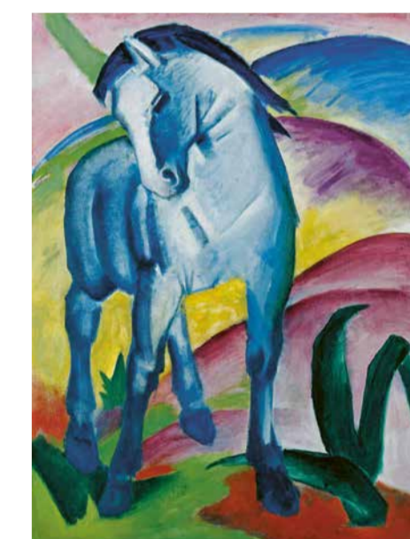
Franz Marc Blue Horse, 1911 © Lenbachhaus

A wealth of top-class museums and collections, displaying exhibits from Antiquity to the present day, are waiting to be explored in Munich. For many centuries, the Bavarian royal family, the Wittelsbachs, promoted the arts in the city that now boasts a centrally located 'Kunstareal' art hub with museums of world renown. This is where you will find the largest collection of works by the 'Blauer Reiter' movement, for example. The museum, partly housed in the former residence of the 'princely painter' Franz von Lenbach with its idyllic garden, is one of the most beautiful spots in the city. The house in the style of a Tuscan villa forms a stunning counterpoint to the new, gleaming golden building designed by the architectural firm Foster + Partner. Following the gift made by the artist Gabriele Münter in 1957, the museum now holds works by Wassily Kandinsky, Gabriele Münter, Alexej von Jawlensky, Marianne von Werefkin, Franz Marc, Paul Klee, August Macke and many others. Under